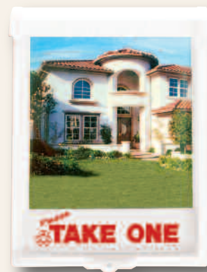
Economy Brochure Box