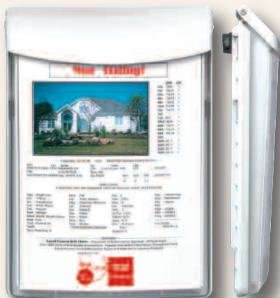
Ultimate Brochure Box

*This item ships from our Los Angeles facility.